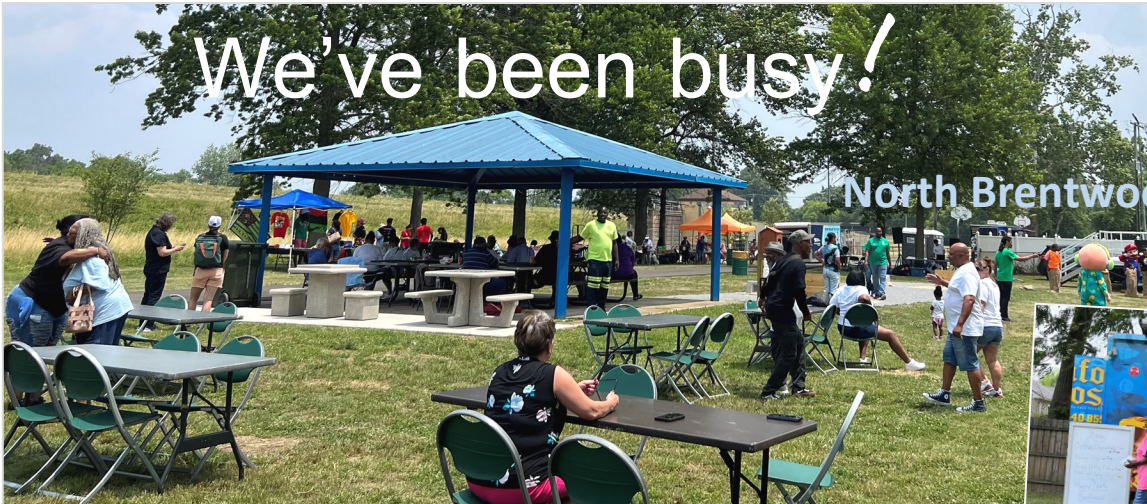
North Brentwood Day