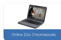
Online 2Go Chromebooks

Electricity Usage Monitors, Playaway Launchpads, and Thermal Cameras