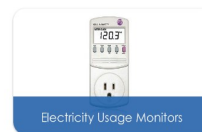
Electricity Usage Monitors