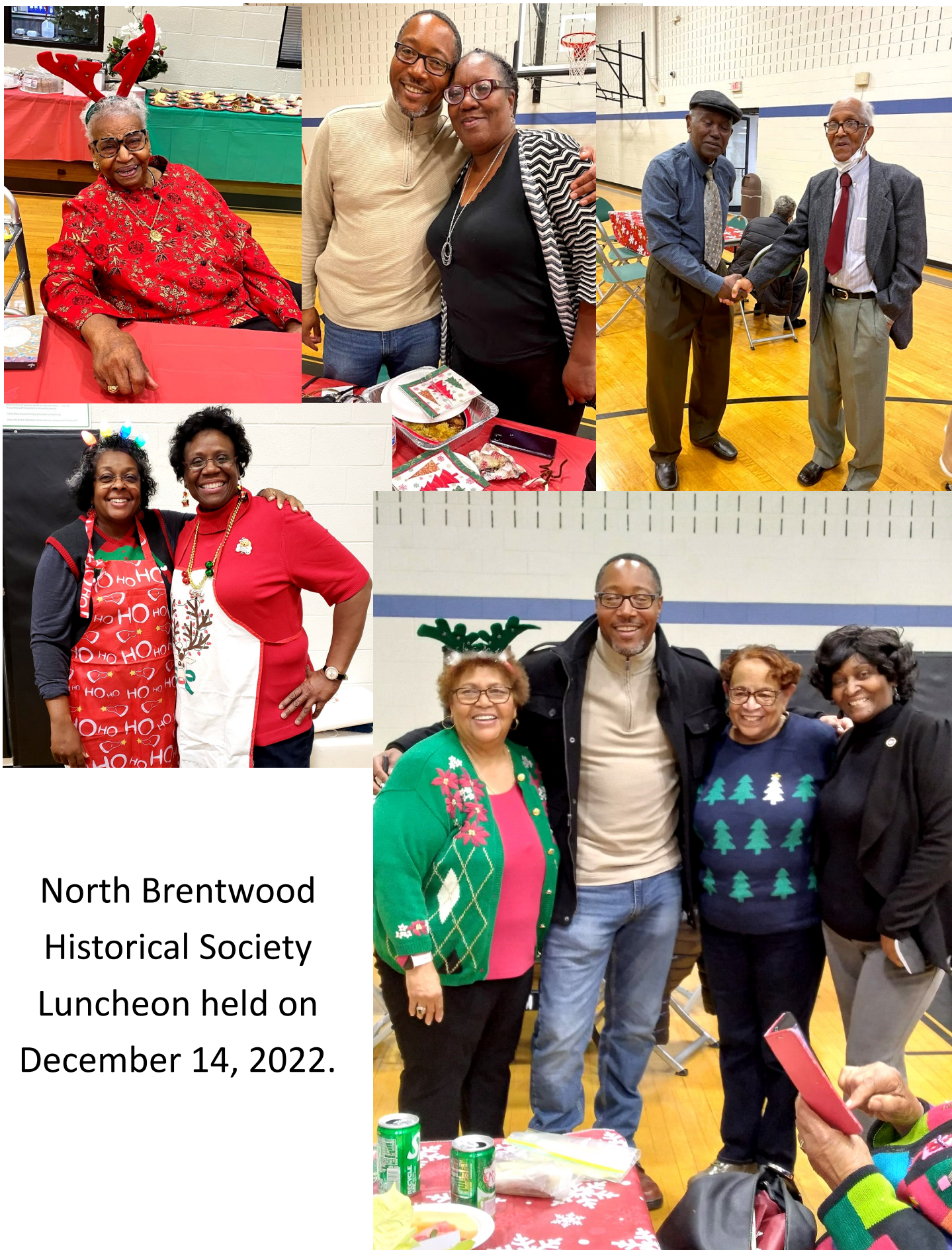
North Brentwood Historical Society Luncheon held on December 14, 2022.