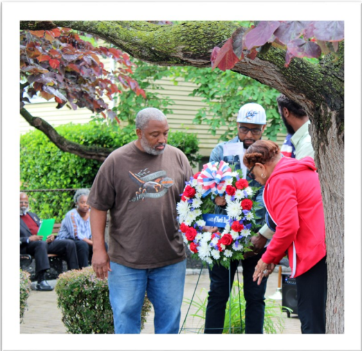
Mayor and Council conduct the annual wreath ceremony.