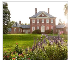
Montpelier Arts Center